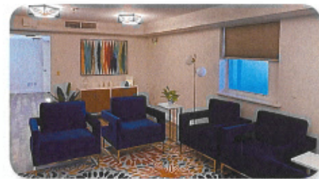
Dedicated space for college students at The Renfrew Center of Coconut Creek, FL

Provides 24-hour support in a homelike setting where treatment includes specialized tracks for trauma and substance use as well as experiential therapy.